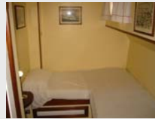
Cruising around Venice away from the noisy crowds