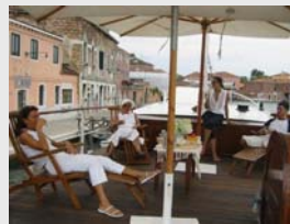
Venice is beautiful when the sun is setting